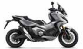
MAT BETA SILVER METALLIC