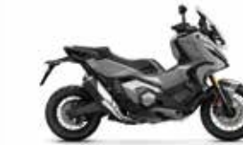
PEARL DEEP MUD GRAY