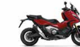
GRAND PRIX RED